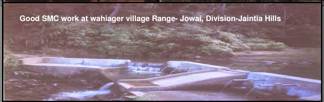
Good SMC work at wahiager village Range- Jowai, Division-Jaintia Hills